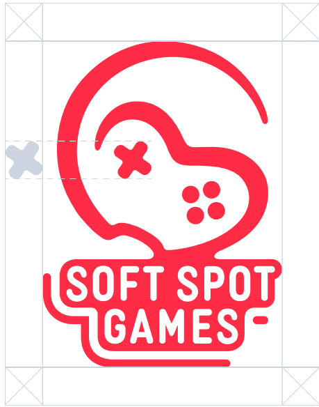
Logo - Portrait