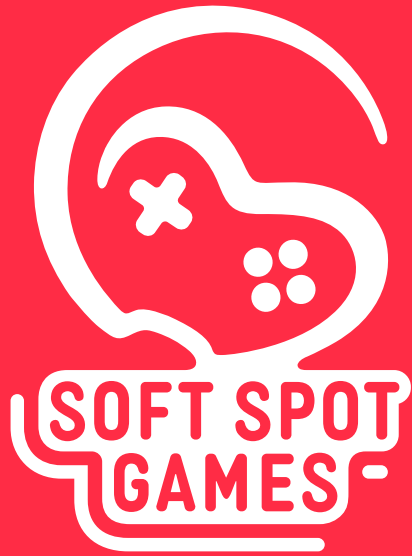
Logo - Portrait